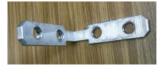
smart quick L jointing