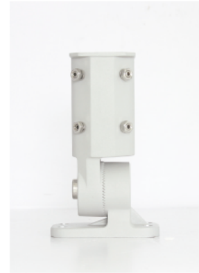
Rotatable Pole Adaptor